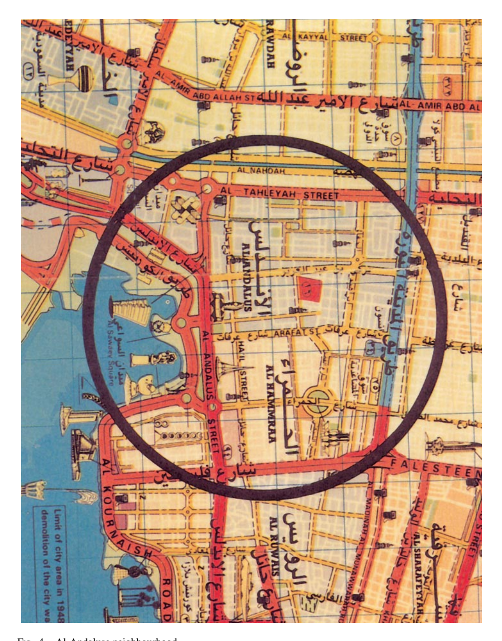
FIG. 4. Al-Andaluse neighbourhood. Source: Greater Jeddah Map, Produced and Published by Engineer Zaki M.A. Farsi, Jeddah, Saudi Arabia.