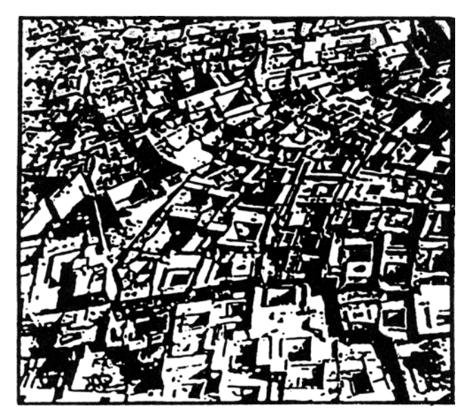
Fig. 2(b). Oblique air photo of a portion of the central area of Fez in Morocco.

city of Chicago from an ecological perspective, and believed that the general approach undertaken by the plant and animal ecologists could be applied to study human societies.